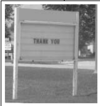
Keep watching the sign out front for upcoming event.

Summer is here. We can feel the warmth from the sun and the smell of fresh cut grass. The Edgerton brothers know that first hand as they have the mowing contract for the Park District this year. With school being out we are looking for adult volunteers to help with summer hours. We would like to offer programming and activities for the youth during their summer vacation and can only do that with the communities help.